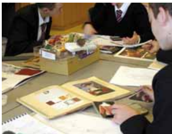
ITC Test Bed project

Students in Years 10–13 (approximately 50 students) had access to approximately 10 handhelds, which were used as a shared resource (class sizes did not generally exceed 10). These devices did not have audio and video facilities, although, in an observed lesson, the students used their mobile phones to take pictures which were then transferred to a computer for later use. In this way, the students extended the functionality of the devices but, when questioned, they