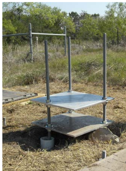
Figure 5. Edwards Aquifer field site monument installation. Plates and long rods were removed after the epoxy cement had cured. Shorter rods were installed and the plates were replaced to form bracing for the vertical rods. Finally, aluminum pillars were threaded to the top of the steel rods, and E2 lowered onto them. The last step involved erecting the instrument shed around E2.