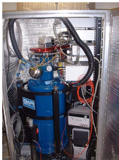
Figure 2. Interior of enclosure E2 showing helium dewar, cold head and cold head frame with rack mounting of most electronics at right.

A portable air conditioning unit supplied cool air to the base of E1, with hot air exhausted from the top E1 to the shed exterior. A fan and duct connecting the two instrument sheds circulated cool air to E1. These systems worked well, although additional reflective insulation on the exterior of the sheds was required to reduce heat load from the sun.