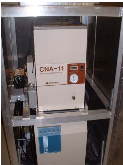
Figure 1. Interior of enclosure E1, containing UPS and refrigerator. Lightning surge protector and thermostatic control for the top-mounted cooling fan are located at mid-level.

The cold head frame is secured to the base of E2 with vibration isolation mounts, and the dewar containing the SG sensor is supported on 3 aluminum pillars. When installing on a concrete floor, the pillars are bolted to an aluminum plate. Installation involves raising E2, sliding the pillar-plate assembly beneath it, and lowering E2 as the 3 pillars pass through clearance holes to support the dewar. During the field trial, the pillar plate assembly was replaced by braced threaded rods cemented into outcropping limestone (Figure 5) with the 3 aluminum pillars threaded onto the rods.