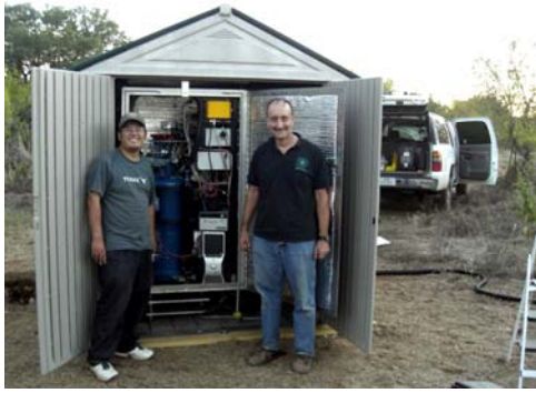
Figure 6. Instrument shed containing E2, during installation November, 2008. A similar shed behind this contains E1. A portable air conditioner in the E1 shed provided cool air for the refrigerator compressor, and was ducted to the E2 shed to cool electronics and the computer. Sheds were covered in reflective insulation to reduce heat load from the sun.