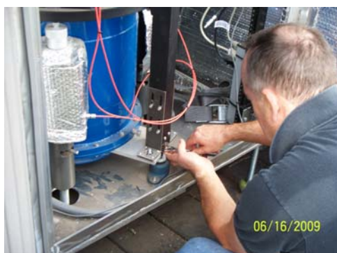
Figure 3. Securing the base of the dewar to the cold head frame with brackets allows E2 to be transported without disassembly.

The cold head frame is secured to the base of E2 with vibration isolation mounts, and the dewar containing the SG sensor is supported on 3 aluminum pillars. When installing on a concrete floor, the pillars are bolted to an aluminum plate. Installation involves raising E2, sliding the pillar-plate assembly beneath it, and lowering E2 as the 3 pillars pass through clearance holes to support the dewar. During the field trial, the pillar plate assembly was replaced by braced threaded rods cemented into outcropping limestone (Figure 5) with the 3 aluminum pillars threaded onto the rods.